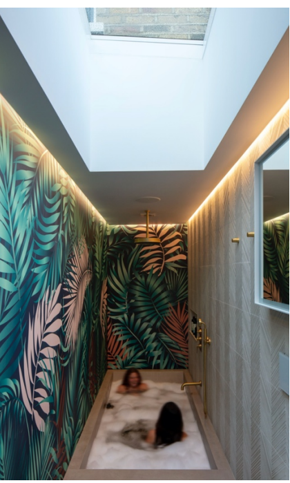
A narrow, 1.5 metre, two storey extension has also provided an abundance of space, allowing the interiors to be completely reconfigured. The existing bathroom has been moved to create a snug room, a single bedroom, and another double bedroom. A dramatic sunken bath with floral jungle ceramic panels adorning the walls has created a spa-like hideaway in the house, and a talking point with visitors!

The new, three square metre snug has been enhanced with a frameless oriel window, wrapping over the roof to provide as much natural light as possible, with a cantilevered window seat inside. Lined with birch ply, it features two hidden retractable screens in the walls to close off the window for privacy or keep the sunlight out for movie afternoons. A wall-to-wall sofa with a pop out double bed transforms the space into a guest bedroom when required.